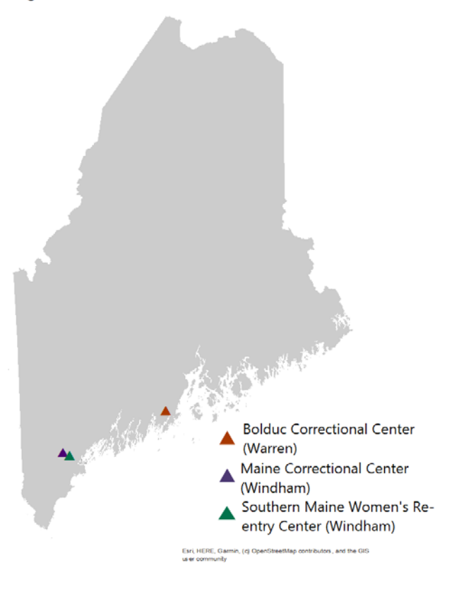
Figure 2. Medication Assisted Treatment Pilot Sites

The Maine DOC MAT pilot program was designed to enroll up to 100 offenders who are 90 days out from release. The Maine DOC facilities participating include: the Bolduc Correctional Center, the Maine Correctional Center (25 from both the men and women's units), and the Southern Maine Re-entry Center (see Figure 2). Individuals who are eligible and enroll in the program receive medication to treat their OUD and behavioral therapy during the balance of their incarceration. Prior to