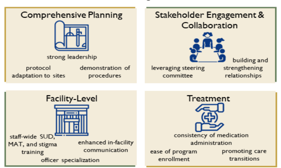
Figure 4. Successful Strategies for Integrating MAT in Correctional Settings

Below is a more detailed description of the strategies used by the Maine DOC to facilitate the successful implementation of MAT services at institutions participating in the MAT pilot program.